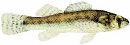
The Arkansas Darter

Darter include protection of occupied habitat from sand and gravel mining, water use modifications to improve spring flow, and establishing riparian buffers to control pollutants from agricultural runoff.