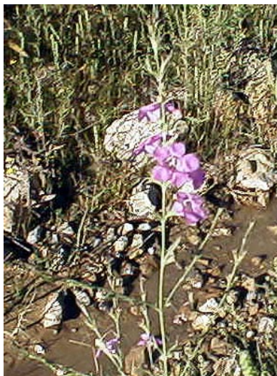
Slender False Foxglove

Slender False Foxglove: Agalinis Tenuifolis , snapdragon family. This plant likes moist soil and can be seen in great numbers in the ditches. It is partially parasitic on roots of other flowering plants and likes acidic soil derived from sandstone.