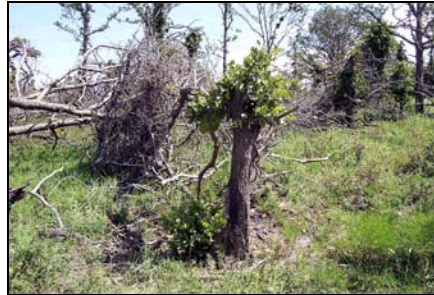
More Tornado Damage