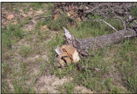
Tornado Damage on TGP