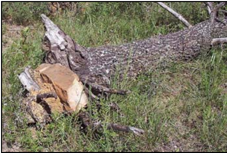
Felled tree with blocks of sandstone

(Continued from page 1) penetrate further, cracking the sandstone to allow water to percolate and collect in quantity within rocky reservoirs. The picture below shows an oak tree felled by tornado that has yanked blocks of sandstone from the ground. Apparently, major regional aquifers lie below the Cross Timbers, most of which are being pumped down faster than they are replenished.