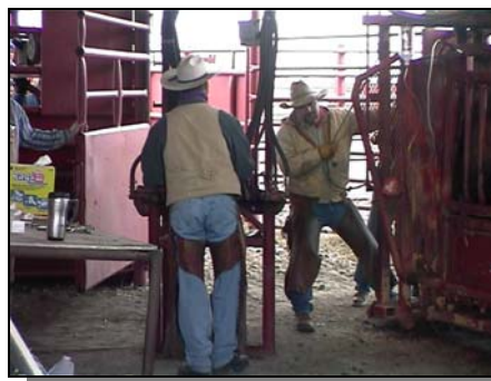
Cowboys hard at work

The annual Round-up was just completed and details will be published in the next issue of The Docent News . Meanwhile, enjoy these photos from the 2003 Round up!