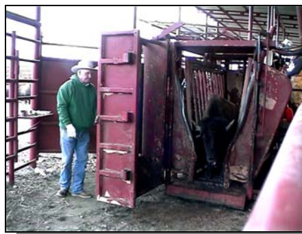
Bison leaving squeeze shoot