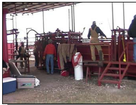
Round up 2003