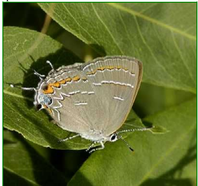
Soapberry Hairstreak Phaeostrymon alcestis Four Canyon Preserve, Ellis Co., OK