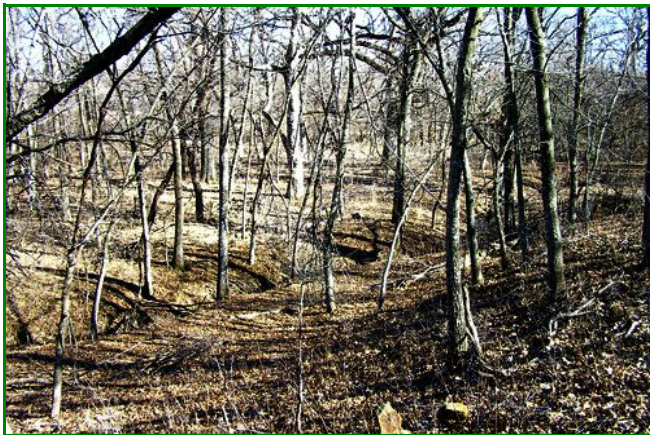
Creek Area in Winter