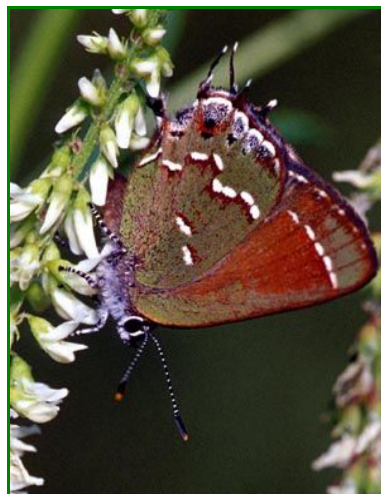
'Olive' Juniper Hairstreak