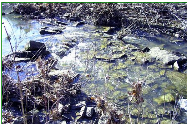
Creek in Winter – by Van Vives

We tend to avoid trips to the Tallgrass Prairie when winter invades it and the colors turn to the more subdued tones of gray and brown. A walk I took recently this February on the short trail showed that there is still beauty in winter and colors range much wider than gray and brown. It may take a little extra effort to find the beauty, but it is well worth it.