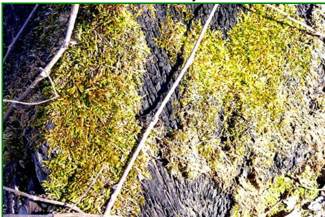
Moss on Log in Winter