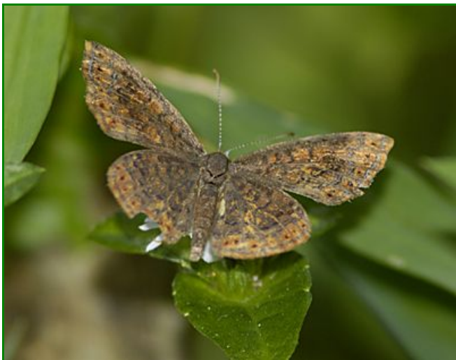
Northern Metalmark Calephelis borealis J.T. Nickel Preserve, Cherokee Co., OK