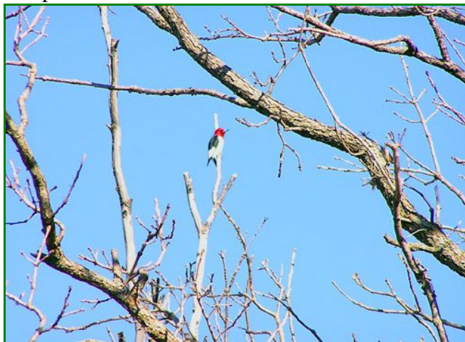
Woodpecker – by Van Vives

Dennis announced the spring work days. Road cleanup will begin on 26 February from 10 a.m. until 3 p.m.; participants should bring their own lunch. Another road cleanup is scheduled for the morning of 14 May, followed by lunch and an afternoon hike on Wild Hog Creek in the south east part of the preserve. Oilfield cleanup will be on 16 th April offering participants the opportunity to see unusual places normally closed to docents and public alike.